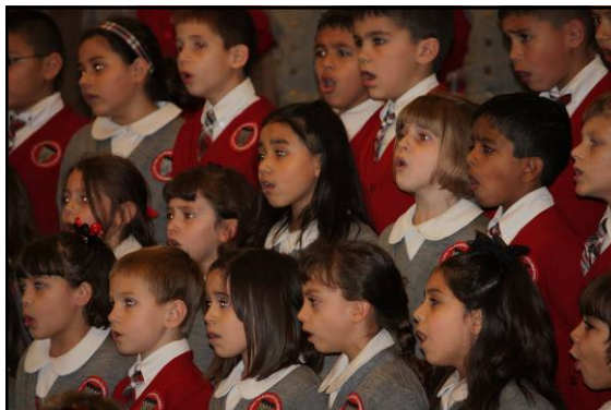
Above: A photo from last year's Grades 1 & 2 Concert.

Children in the lower school grades PK and Kinder perform on Thursday at 2 pm and those in grades 1 & 2 present their Christmas music programs at 2 pm. Both lower school concerts are in St. Anthony Hall.