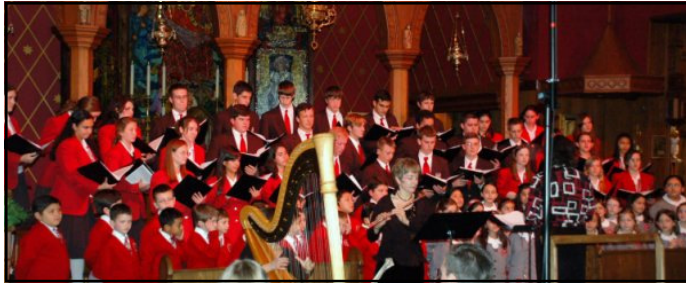
Photos from the Dec. 14 Concert